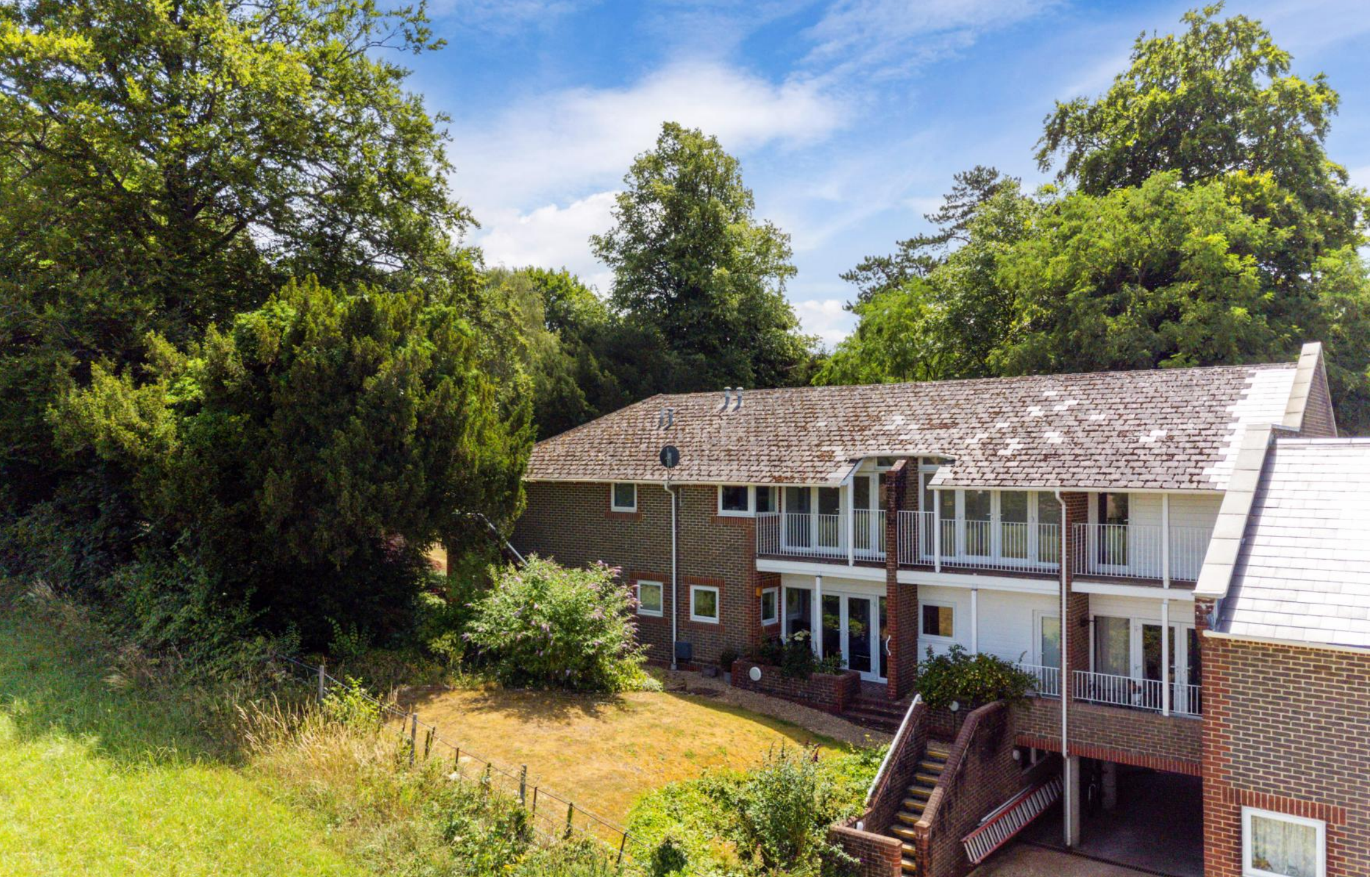
19 Little Dean Court, Stockbridge